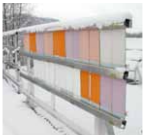
Tested: dispersion plasters sustainably convincing.

quartz. Cellulose serves as a thickener and water determines the consistency. Based on aqueous bonding agents, they contain a very low quantity of organic solvents (aromatic-free) or none at all. If at all, only a very small proportion of film-forming agent is present in coatings for the outside of buildings. And low-emission decorative plasters are generally used for the inside.